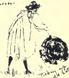
Picking up an old hat & keep